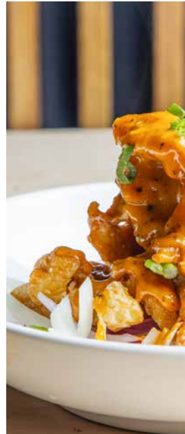
MONGOLIAN STYLE CRISPY SHREDDED CHICKEN

050 NEW Ginger & Spring Onion Lamb 14.80