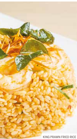
KING PRAWN FRIED RICE