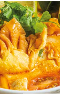
CRISPY WON TON TOM YUM SOUP