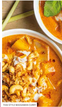
THAI STYLE MASSAMAN CURRY