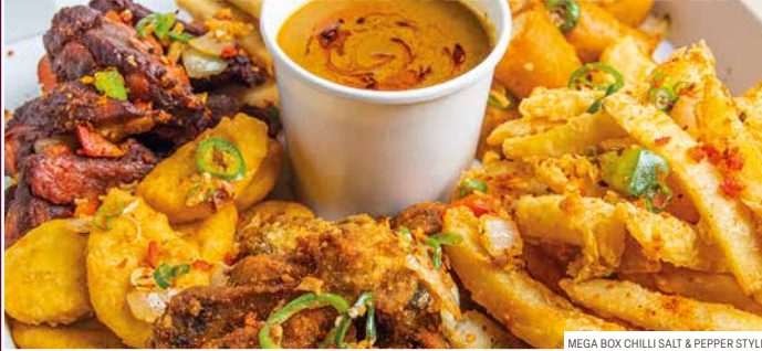
MEGA BOX CHILLI SALT & PEPPER STYLE