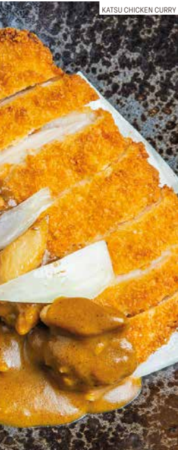
KATSU CHICKEN CURRY