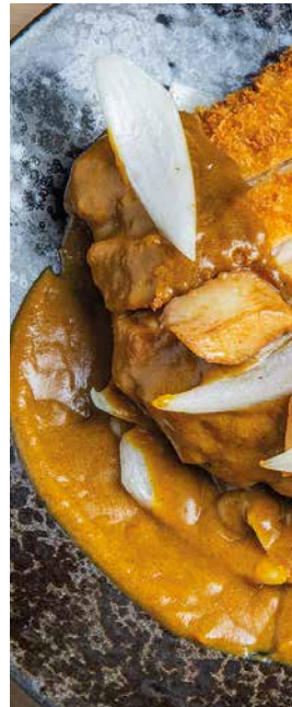
KUNG PO CRISPY SHREDDED CHICKEN